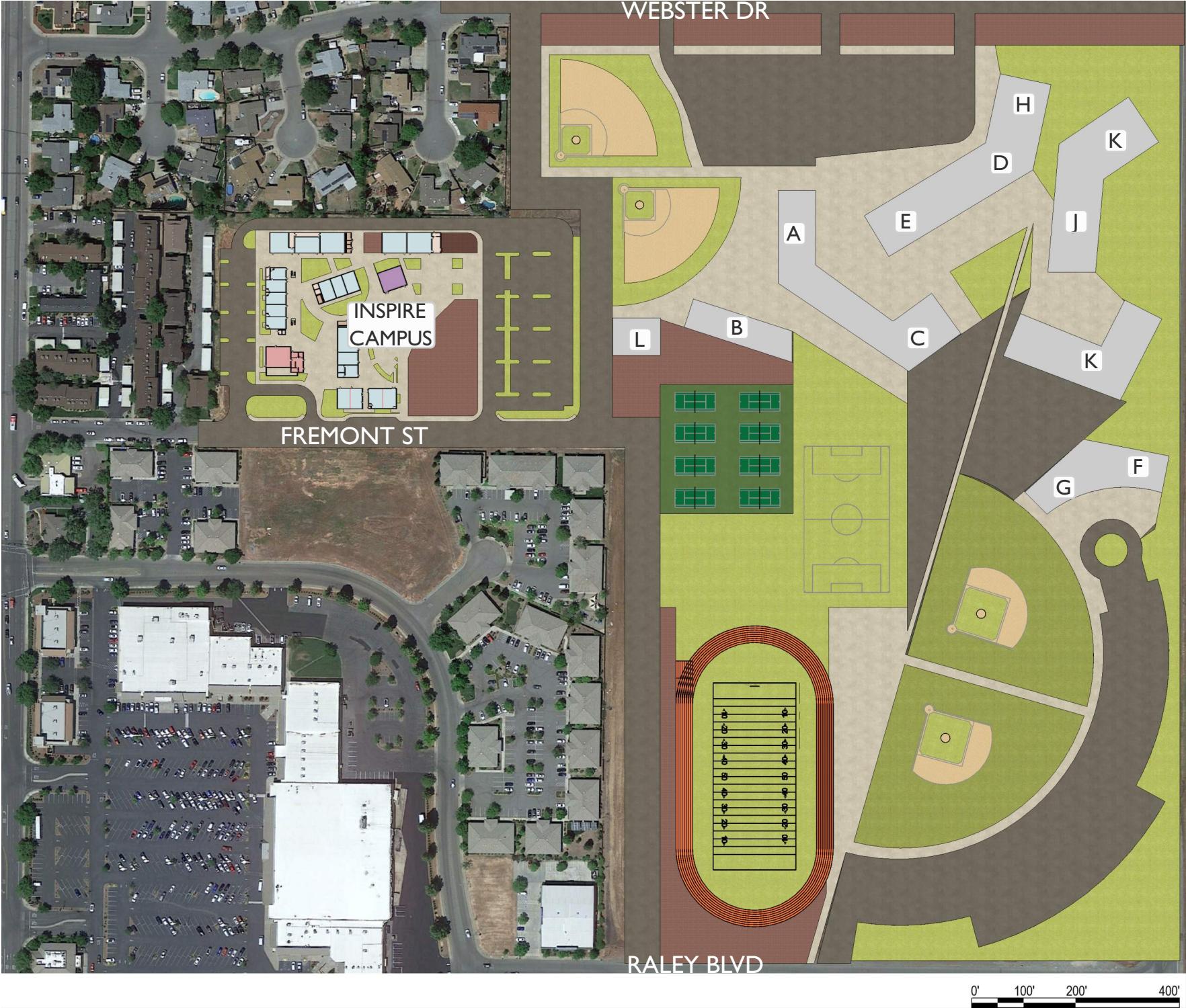
Canyon View High School

The District owns approximately 50 acres for a future high school campus. The need for the development of the site as a new high school is not anticipated within the horizon of the current demographic projections through 2030. Future updates to the Facilities Master Plan should review the need for the new high school in context of updated projections.